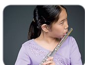
play (the flute)