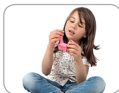
make (a paper bird)