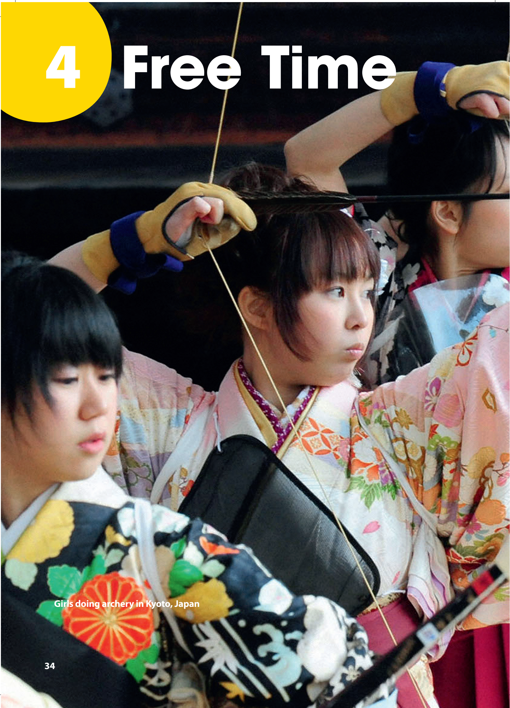
Girls doing archery in Kyoto, Japan