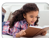
read (a story)